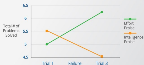
The Impact of Praise on Performance After a Failure

For example, studies on different kinds of praise have shown that telling children they are smart encourages a fixed mindset, whereas praising hard work and effort cultivates a growth mindset. When students have a growth mindset, they take on challenges and learn from them, therefore increasing their abilities and achievement.