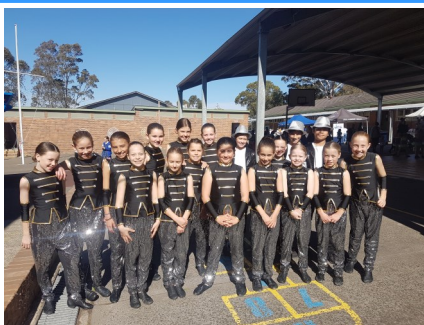
Stage 2 Camp

I look forward to going along to the Stage 2 Camp next week at the Great Aussie Bush Camp. Just a reminder that if you are yet to return your child's medical information please do so as soon as possible. Also please remember that next Wednesday morning the students will need to be at school by 8.00am and the bus will leave at 8.30am sharp.